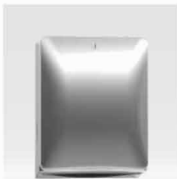
Towel Dispenser Model 2A10