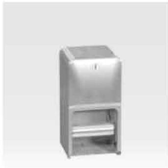
Toilet Tissue Dispenser Model 5A10