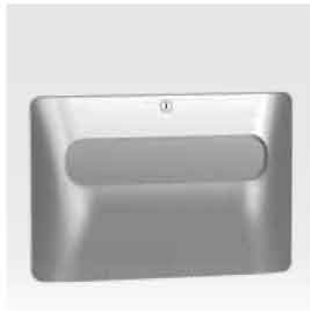
Seat Cover Dispenser Model 5A40