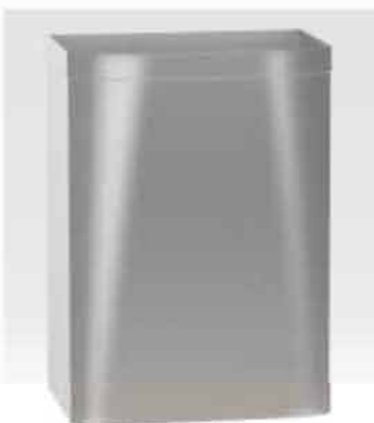
Waste Receptacle Model 3A15