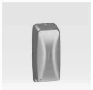
Soap Dispenser Model 6A00