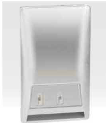
Napkin/Tampon Vendor Model 4A20