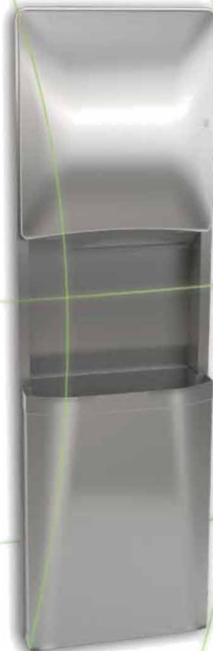
Combi Towel Dispenser/ Waste Receptacle Model 2A05

SOAP DISPENSERS accept all liquid soaps and hand sanitizers. Hundreds of thousands of cycles, tested in high traffic settings.