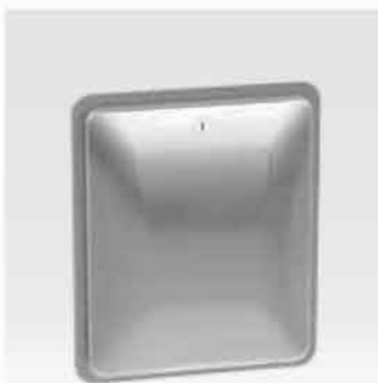
Recessed Napkin/Tampon Waste Receptacle Model 4A00