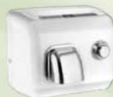
DR-N Series White Push Button