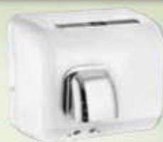
DR-TN Series White Automatic

Maintenance free Quiet, dependable operation 360° revolving nozzle Vandal resistant Durable finish-looks new for years 10 year limited warranty