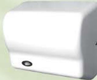
GX Series White Finish