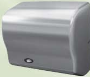
GX-C Series Chrome Finish