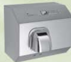
DR-TNSS Stainless Steel Automatic