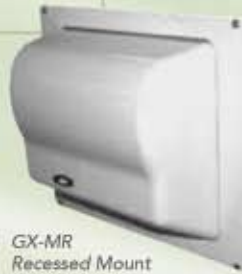
GX-MR Recessed Mount

A RECESS KIT is available to reduce the depth of the dryer to less than 4" from the surface of the wall on all models.