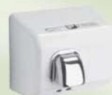
A-T Series White Automatic / Surface Mount

THE DR AND A SERIES HAND DRYERS' TIME-TESTED DESIGN FEATURES QUIET, DEPENDABLE OPERATION IN A HEAVY DUTY, VANDAL-RESISTANT PACKAGE.